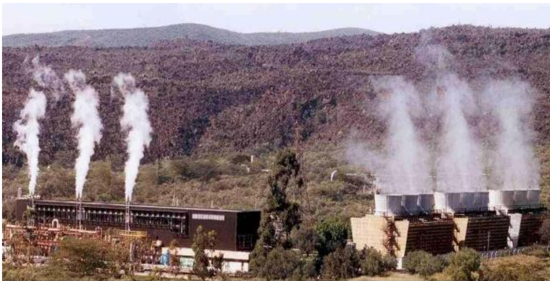
Figure 2: A view of Olkaria 1 Power plant, the oldest geothermal plant in Kenya

The Olkaria 1 power plant is the oldest plant of all the plants within Olkaria, generating 45 MWe from steam tapped from 24 out of the 33 drilled wells assigned to this plant. One of the 33 wells is being used for re-injection, two have been retired while the rest serve as standby wells. Currently the field has steam capable of generating an additional 25 MWe. In 1986, drilling was expanded beyond Olkaria East field. By 1992, a total of 30 wells had been drilled in the Olkaria Northeast field. This wells had steam enough to produce 105 MWe. This was however followed by a period of political instability that led to stallment of geothermal development until 1999. In 2003, a 70 MWe Olkaria II (units 1 and 2) were commissioned. A third unit generating 35 MWe was commissioned in May 2010. The Olkaria II power plant produces a total of 105 MWe using 22 of the 30 drilled wells supplying steam to the three units that make up the plant.