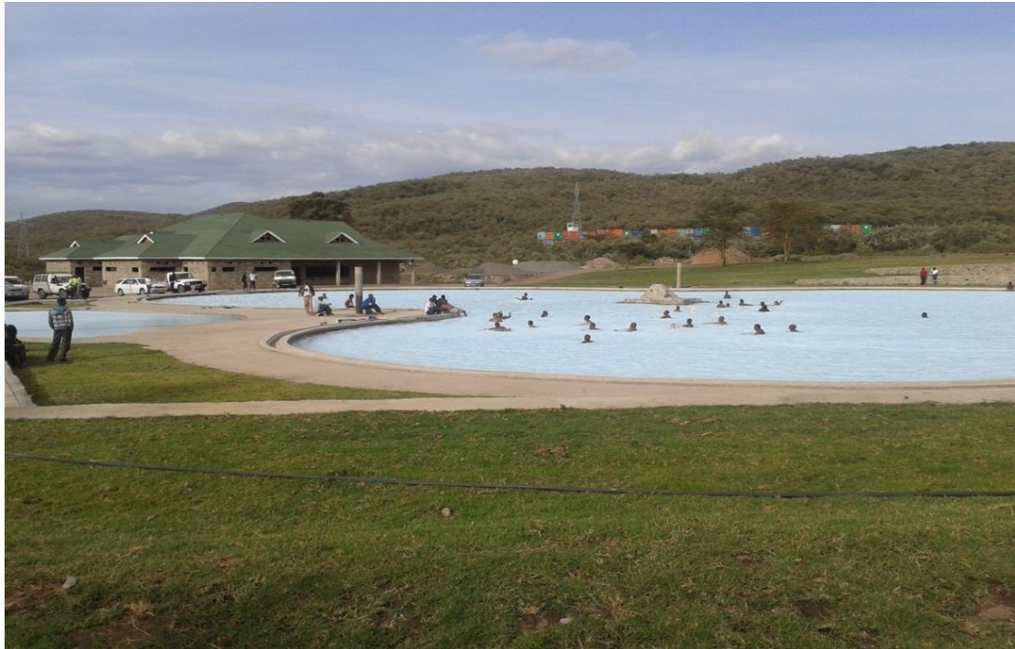
Figure 3: A view of the Olkaria Geothermal Spa.

again transferred to another pool where it's cooled further to 35 °C before flowing to the main pool where visitors enjoy their warm bath (Figure 7). The geothermal Spa started operations in 2013 and is the only natural spa in Africa. Lake Bogoria hotel have utilized hot springs for use in a swimming pools. The hot springs are directed into a swimming pool where residents and visitors enjoy a warm bath.